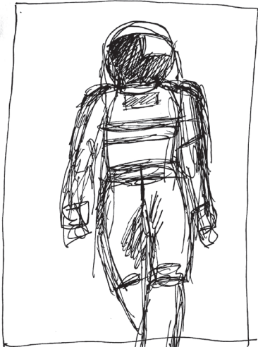
COSMO COVER GENERATED BY DALLE

THE CREATIVE USE OF AI IS WHAT I FIND THE MOST INTERESTING.